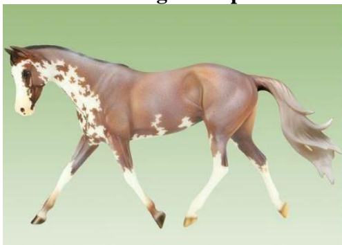
#1877 Traditional Full Moon Rising – Strapless mold