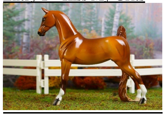
Entry 1 – Kiss My Grits