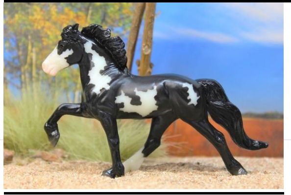
Best Appaloosa Name Entry 4 – Flammable Jammies