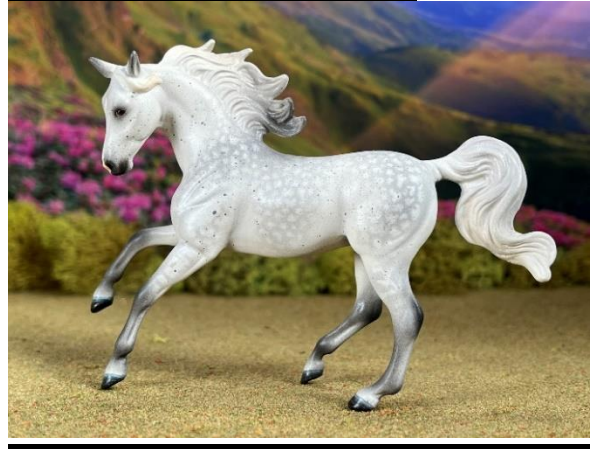
"Beautiful Queen Esther" – Jewish