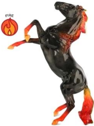
Rearing Mustang Brandell - Elements Series