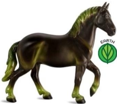
Brabant ~ Terran Elements Series