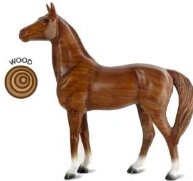
Standing ThoroughbredTeak - Elements Series