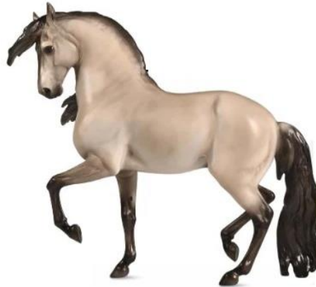
Amazigh Stallion ~ Cossaco Champion Lusitano