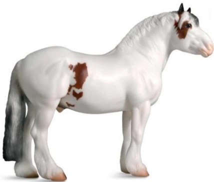
Rhennish Drafter - Legend