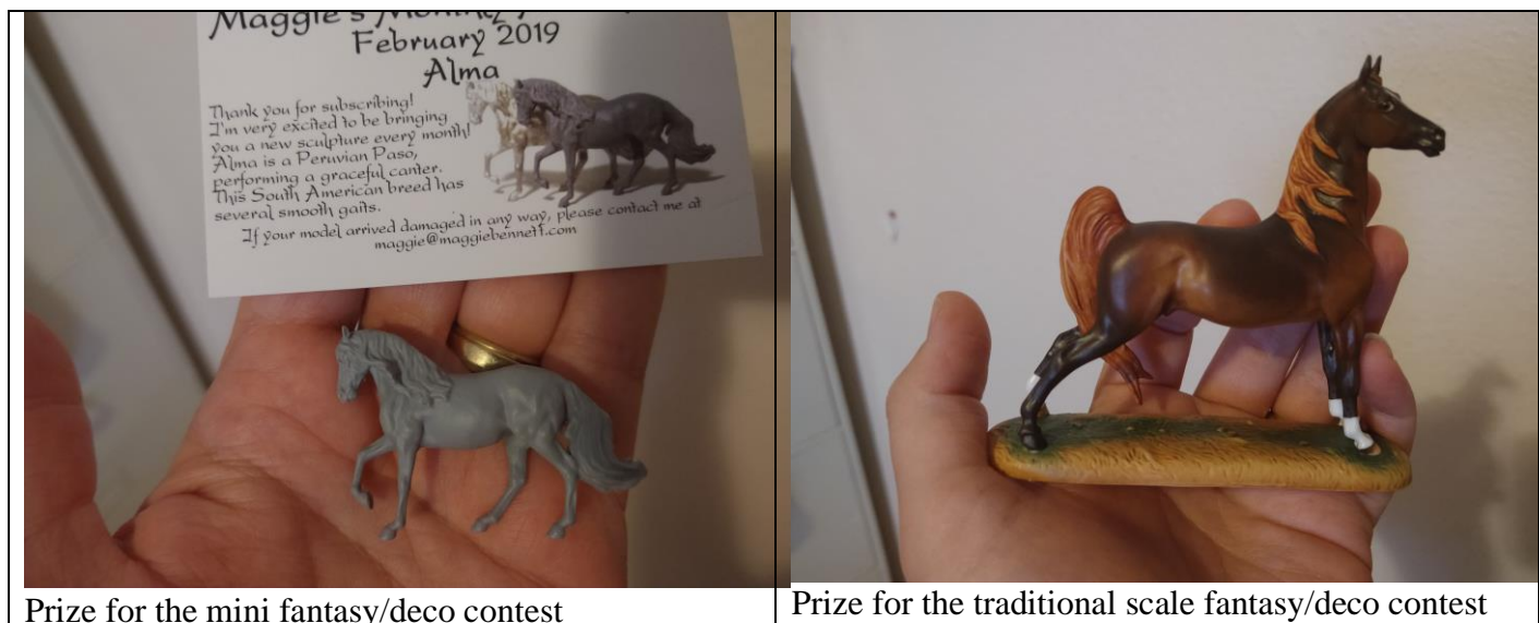
Prize for the mini fantasy/deco contest