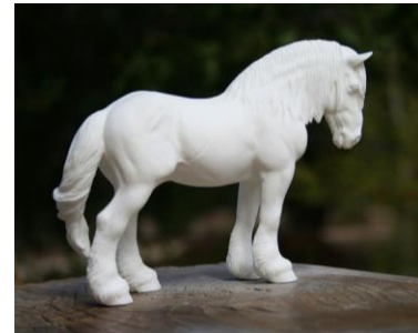
Prize: Ardennes Stallion AR