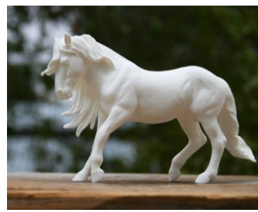
Black Forest Stallion