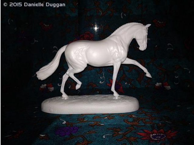
Prize for the winner!!!